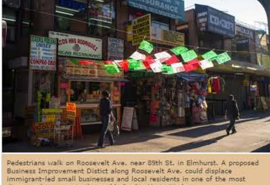
Pedestrians walk on Roosevelt Ave. near 89th St. in Elmhurst. A proposed Business Improvement District along Roosevelt Ave. could displace immigrant-led small businesses and local residents in one of the most diverse urban areas in the world.

CURRENT ISSUE NYC NATIONAL INTERNATIONAL CULTURE CALENDAR MULTIMEDIA BLOGS ARCHIVES STORE ABOUT US