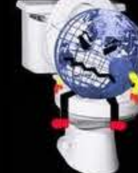
The Crap-O-Sphere ("Crappy")

"Let us dare to read, think, speak and write." - John Adams, 1765